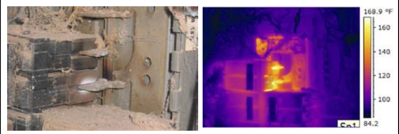
Photo set #2. The section of the electrical panel board shown on the left is an actual picture of where the breaker snaps into the bus bars. Note the extreme heat marking shown near the breaker stab-in terminals. The infrared photo of this panel on the right shows this area to be at nearly 170 degrees F. This is a residential-duty panel in an older house upgraded to full tunnel, and the panel cannot handle the added electrical load. The solution is immediate replacement of the panel and breakers with commercial-rated equipment.

Photo set #1. Connecting high-current wires with a split bolt connector, as shown in left photo, is very likely to cause problems eventually. Over time the resistance of the connection increased, the junction began to heat up, and the two conductors burned apart. The right-hand photo shows the safe way to connect wires, in a protective junction box where the wires can be fastened by an electrical lug kit that can be torqued to meet the manufacturer's recommendations using a torque wrench. This type of connection is far less likely to overheat and fail.